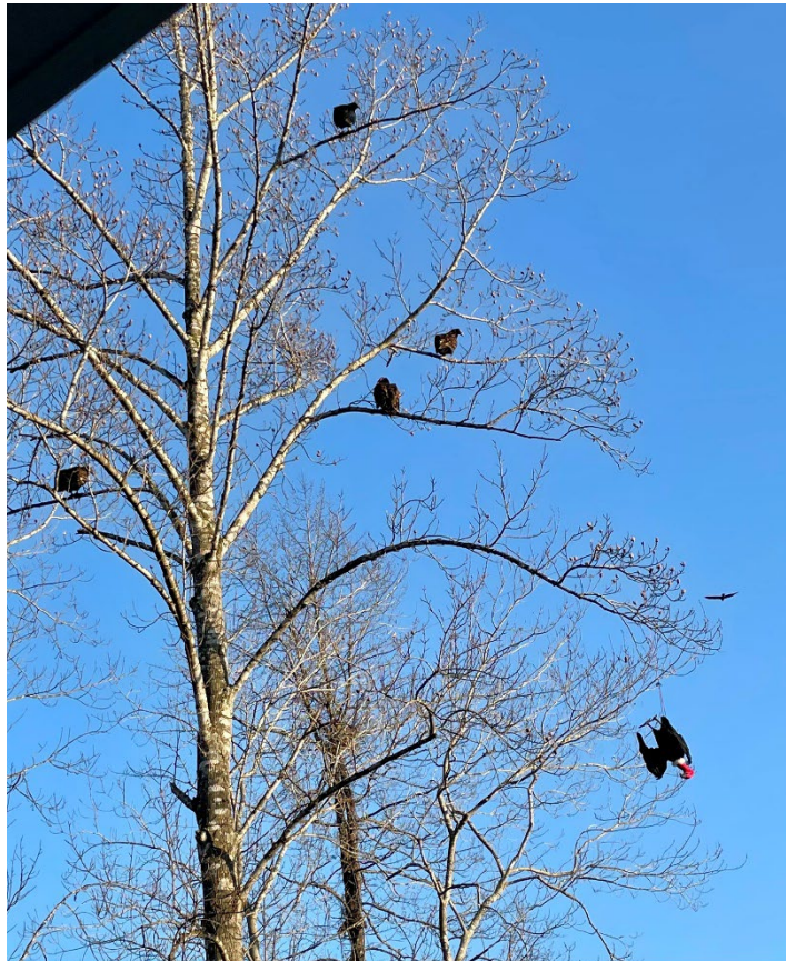
Black Vulture Effigy

On February 18, 2026, R-Board Staff received an email from a nearby resident regarding numerous Black Vultures congregating on their property daily. The resident asked if R-Board Staff could provide assistance in the removal of the vultures. In response, R-Board Staff utilized various abatement tools to remove the vultures from the property and surrounding neighborhood. On March 13, the resident reached out to thank R-Board Staff for the noticeable “major change” on their property.